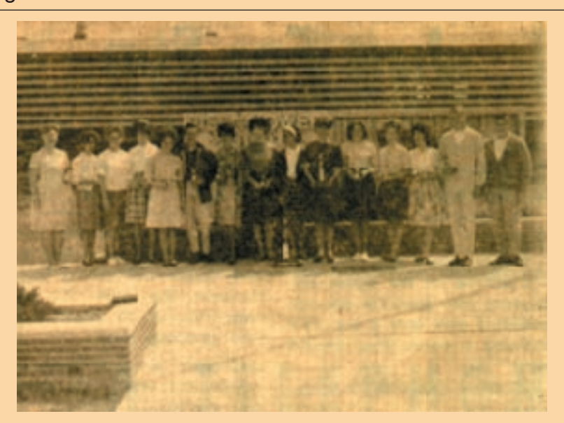
These lucky students won first place in their language field.